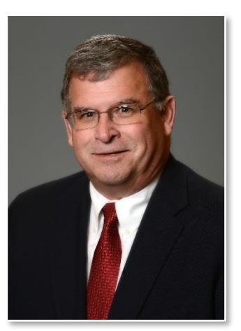
Storm Gray paper

Studio lighting makes a headshot professional. But it is our talented photographers that bring out a comfortable smile to give a genuine headshot you'll be proud to present to the world.